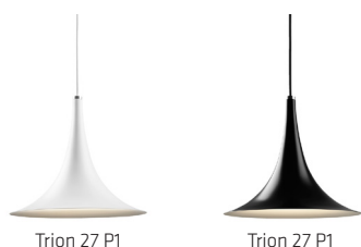
Trion 27 P1